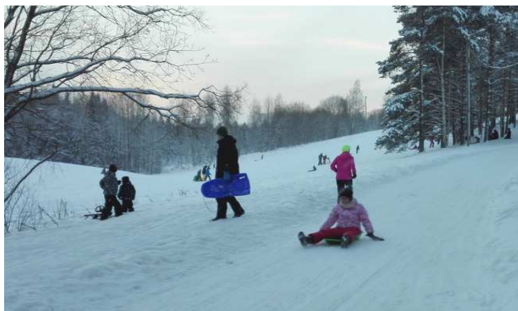
Figure 1. Winter joy in January 2019 at Helsinki.

Every home in our network is also used as the home, permanent or occasional, of the host. This means on one hand that none of us is ever making their living on your innocent will to visit our country and on the other hand that your visit has no undesirable effect on the local house rents.